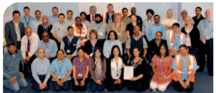
Heathrow CWU members celebrate success in the HWDC learning centre

"It also highlights what can be achieved through a genuine partnership sharing the same goals: full credit should be given to all those involved, especially the learners who put in so much effort," he says.